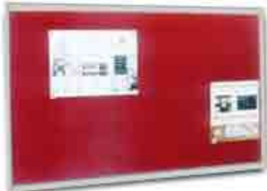
Flannel Pin up board – Simple Aluminium frames – Wall mountable