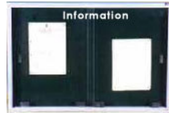
Flannel Pin up board with Glass Enclosure.