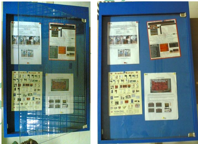
Flannel pin up board with glass enclosure and Light Fitting