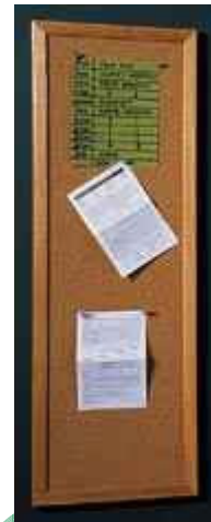
Cork Pin up board – Wall mountable – Framed in elegant White cedar frames