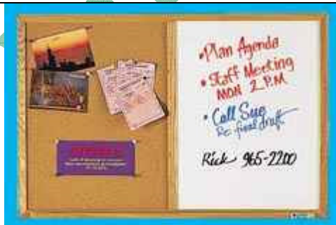
Combination Board – White cum Pin board – Wall mountable