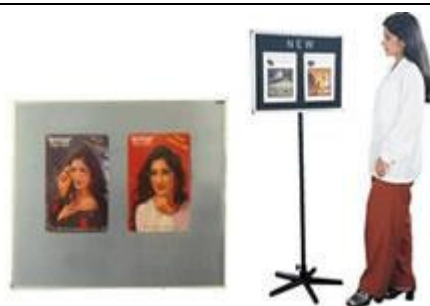
Flannel Pin up board mounted on a Elegant Stand