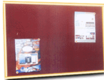
Flannel Pin up board – Elegant White Cedar frames – Wall mountable