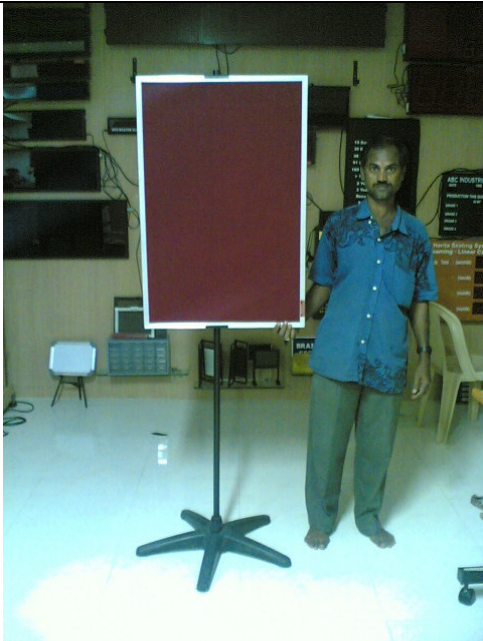
Flannel Pin up board mounted on a Elegant Stand – Steel colour polish on aluminium frames for board